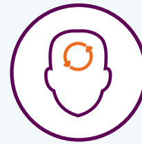
Impaired executive functioning